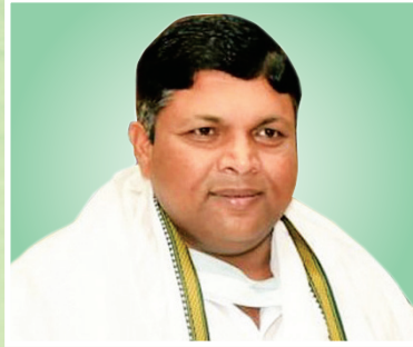
Sri Badal Minister of Agriculture, Jharkhand

Sri Badal Minister of Agriculture Department of Agriculture, Animal Husbandry & Co-operative Nepal House, Doranda Ranchi, Jharkhand - 834 002