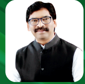
श्री हेमंत सोरेन माननीय मुख्यमंत्री झारखण्ड सरकार